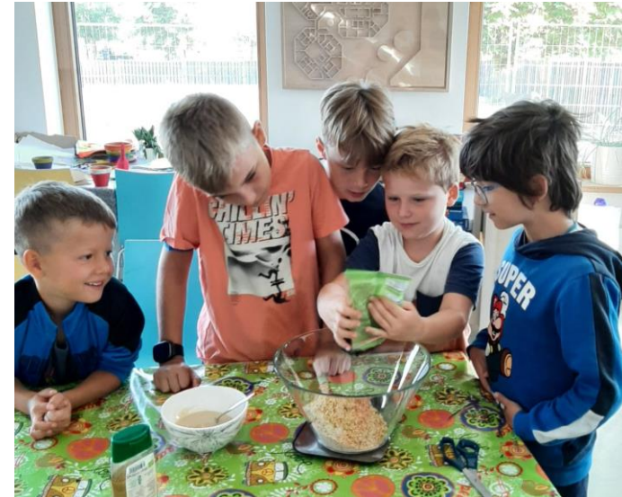
Sommer – Art of chocolate