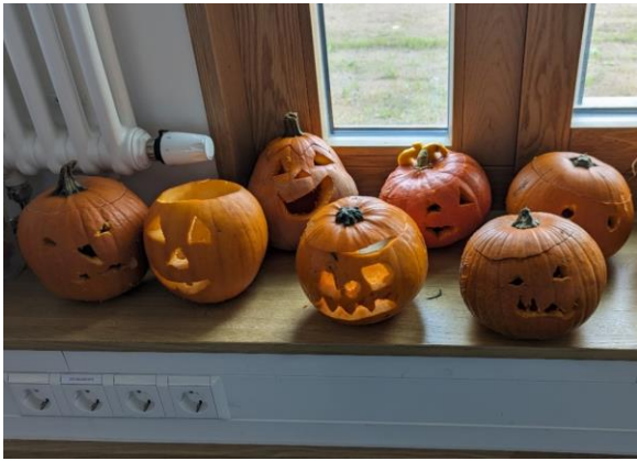
Autumn– Campus Camp Creepy Week