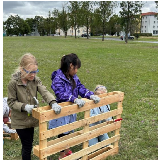
Sommer – Camping & building huttts