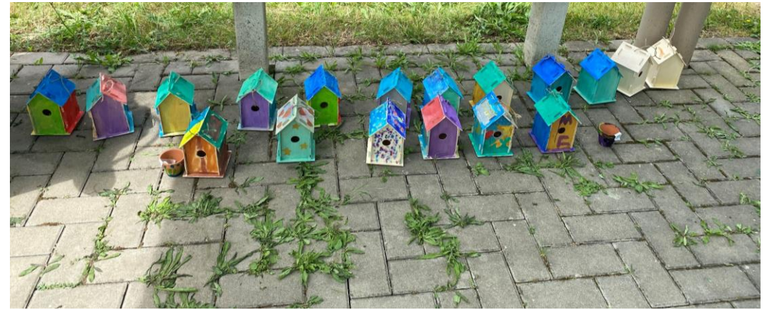
Summer – Project “protect earth“