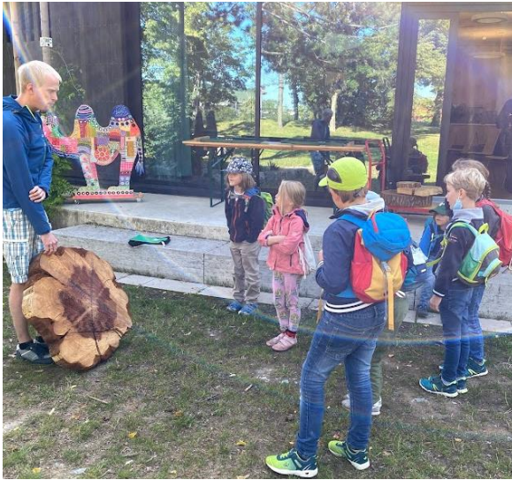
Summer – Kids learning about trees and their environment