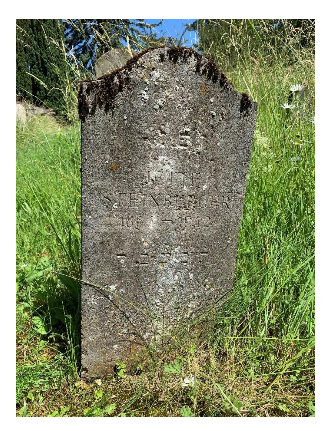
Photo 3: This picture shows one of the small concrete gravestones, the gravestone of Jette Steinberger, born 1864 and died 1942. The top of the stone is overgrown with dark moss.