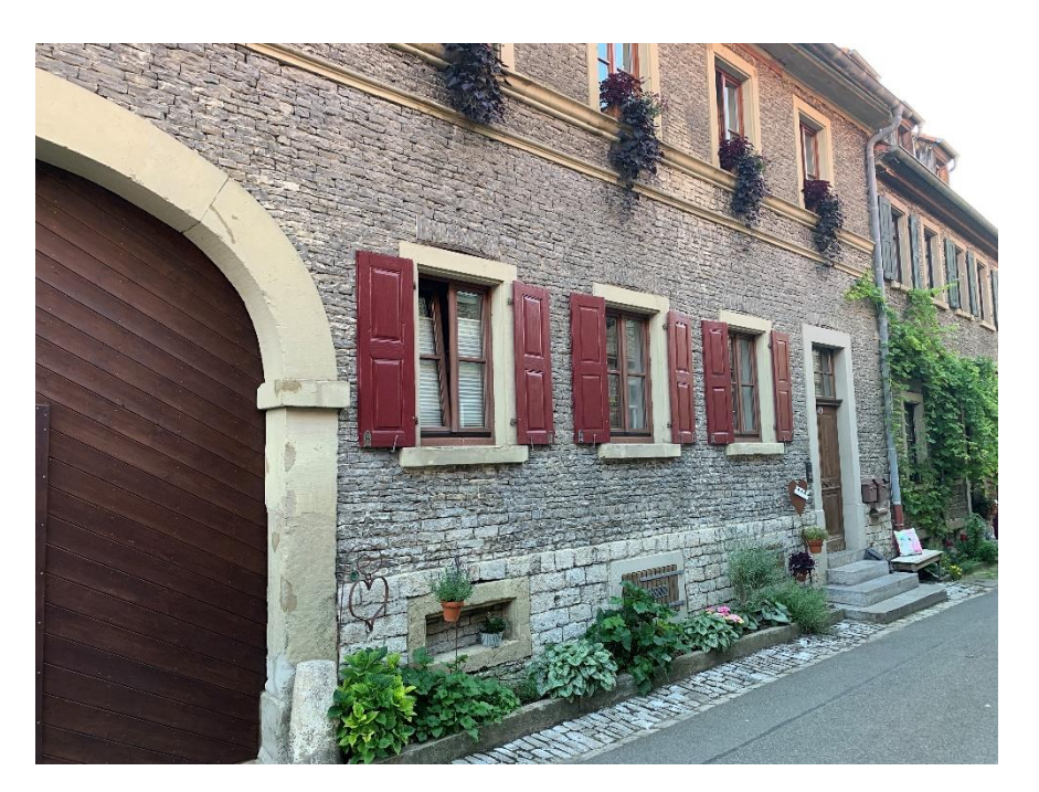
Photo 6: This picture is a photo of the Steinberger house as it looks today. It is a stately house made of natural stone, with wine-red shutters. The house is decorated with flowers on the floor and on the window sills on the second floor.

Photo 5: The picture shows a hand-drawn historical map of Dettelbach in shades of brown and green. One house is marked with a blue circle as the home of the Steinberger family.