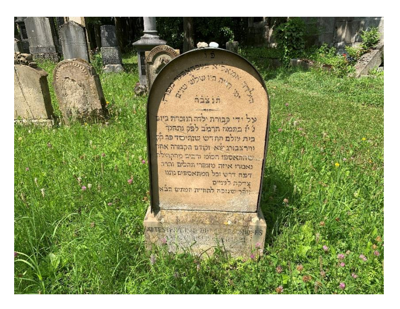
Photo 2: The picture shows the oldest gravestone in the cemetery. It is about 60 cm high, of ochre colour and has a Hebrew inscription. Below is written in German "Oldest gravestone of this cemetery, Amalie Bechhöfer 1881" (The date should be corrected to 1882)".

Photo 1: The picture was taken at the Würzburg Jewish Cemetery and shows several rows of gravestones, most of them identical, rather small and made of concrete. They look plain and stick out of the green grass.