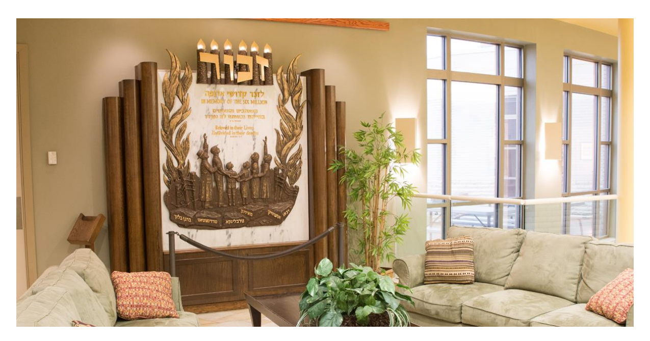
Photo 9: This picture shows the Holocaust memorial wall at the Jewish Community Center of Greater Dayton. It is a work of art and consists of a white marble plaque with a bronze relief framed by wooden posts. The relief shows people stretching their arms upwards where the golden inscription in Hebrew and English reads: In memory of six million - loved in life, undivided in death.