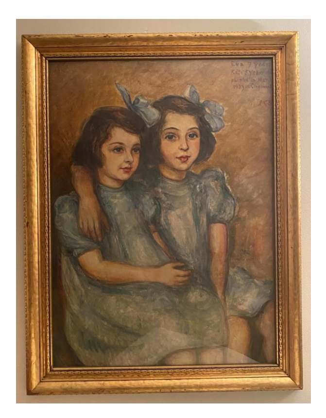
Photo 7: This picture is a painting. The signature in the upper right corner reads Eva 7 years, Käte 5 years, painted in Cincinnati in March 1939. It shows two girls in the same light blue dress. Both girls are sitting, the older girl more in the foreground holding the other around her waist, while the younger has her arm around her sister's neck. The expression of the painting is calm and the girls' faces reveal contentment.