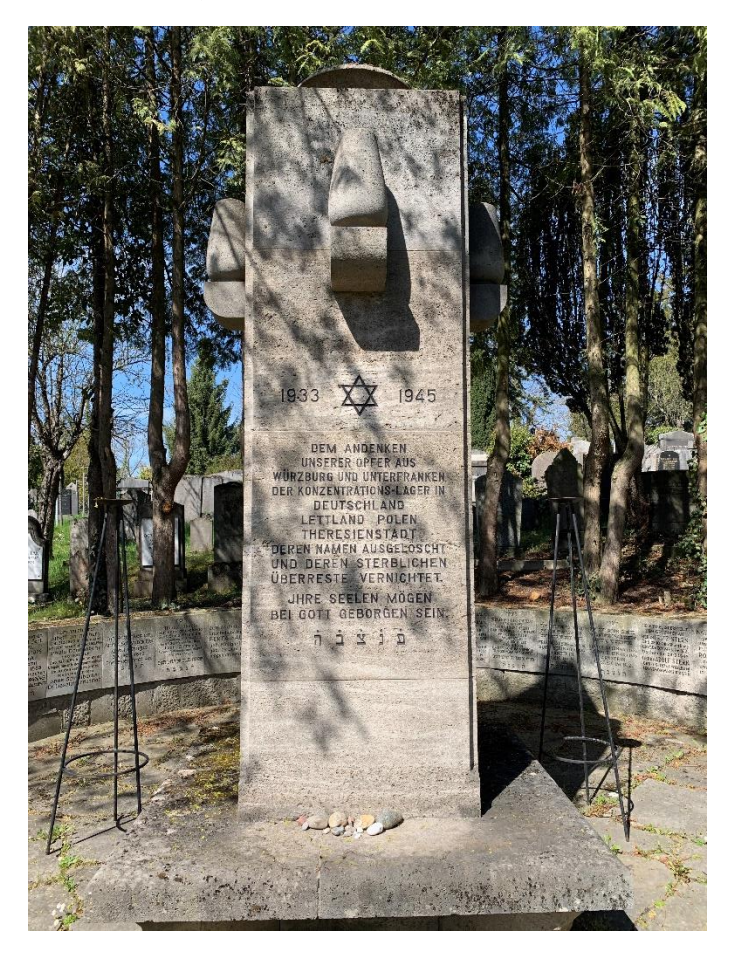
Photo 10: The picture shows a photograph of the Holocaust Monument in the Jewish Cemetery in Würzburg. The Monument is 4 metres high, in the shape of gravestone with the typical Hebrew engraving at the bottom. In the centre, it bears an inscription honouring the Jewish victims of the Shoah that came from Würzburg and Lower Franconia.

Photo 9: This picture shows the Holocaust memorial wall at the Jewish Community Center of Greater Dayton. It is a work of art and consists of a white marble plaque with a bronze relief framed by wooden posts. The relief shows people stretching their arms upwards where the golden inscription in Hebrew and English reads: In memory of six million - loved in life, undivided in death.