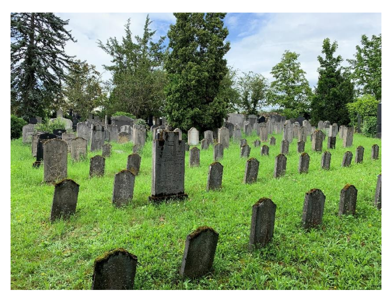
Photo 1: The picture was taken at the Würzburg Jewish Cemetery and shows several rows of gravestones, most of them identical, rather small and made of concrete. They look plain and stick out of the green grass.