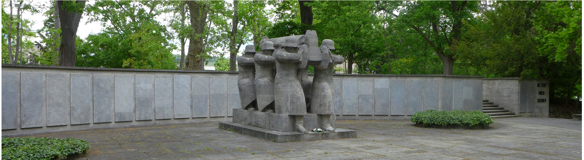
fig. 3: Sculptures of six imperial German soldiers carrying a fallen comrade.