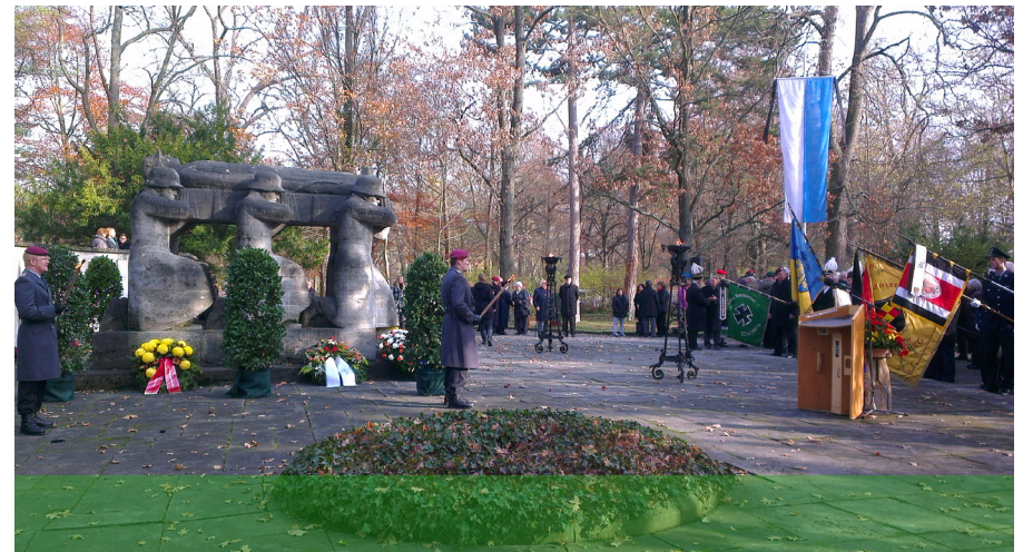
fig. 4: The Kriegerdenkmal on the Volkstrauertag.