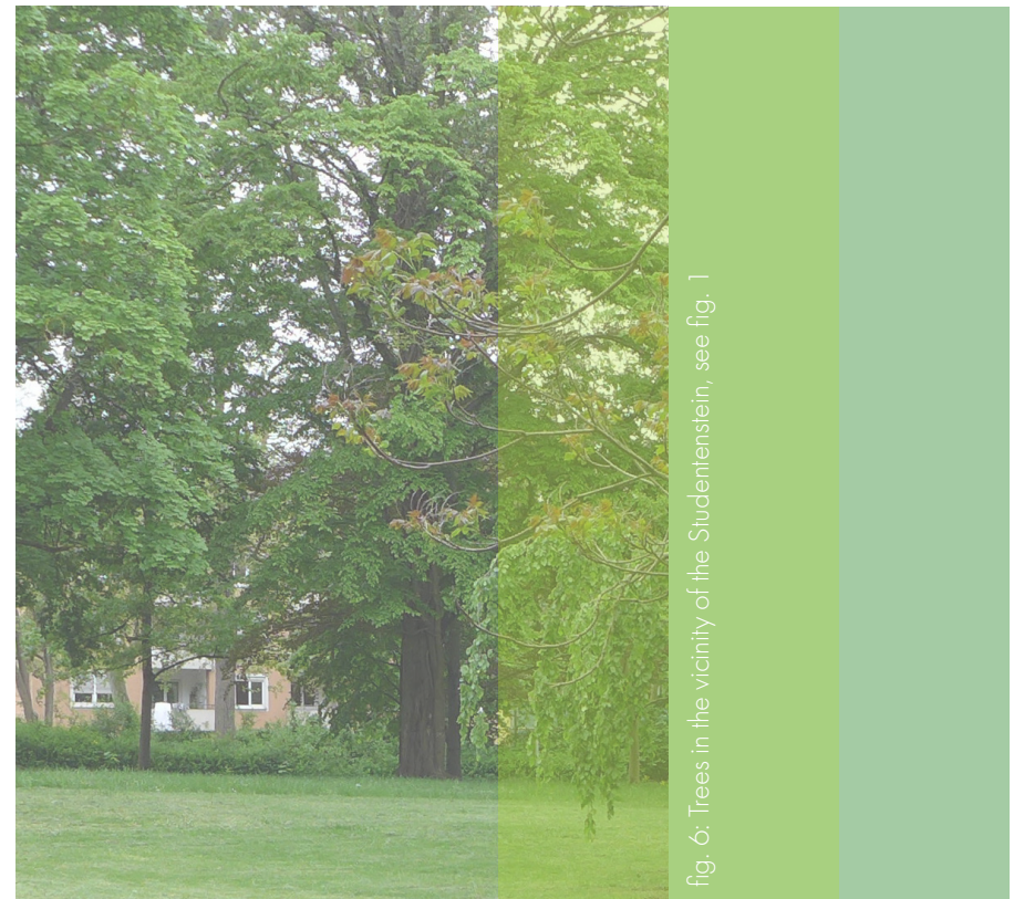
fig. 6: Trees in the vicinity of the Studentenstein, see fig. 1

In the center of the park there now is a large rectangular water basin, on one side of which the relief will be placed. It will then be accessible through a kind of footbridge. The relief will also be a waterfall, the water of which pours into the basin. Since the back of the relief is already finished, it is already possible to get a little foretaste of what this waterfall should look like. The whole park is framed by a chain of light poles that were placed behind the green spaces on the sidewalk around the park. The grounds are accessible from all sides. The statue of General Pershing was integrated in the new memorial.