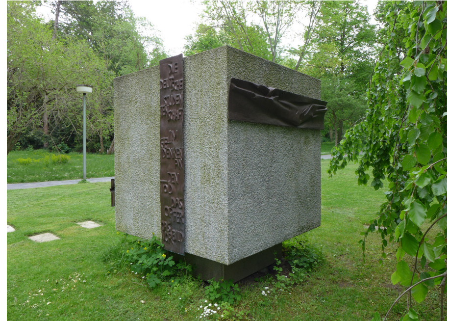
fig. 1: The Studentenstein in its current form.

During the time of National Socialism, the Studentenstein was known as „Langemarkstein“ 3 and was the location of party rallies. It was also relocated, a swastika was added and the golden eagle was enlarged.