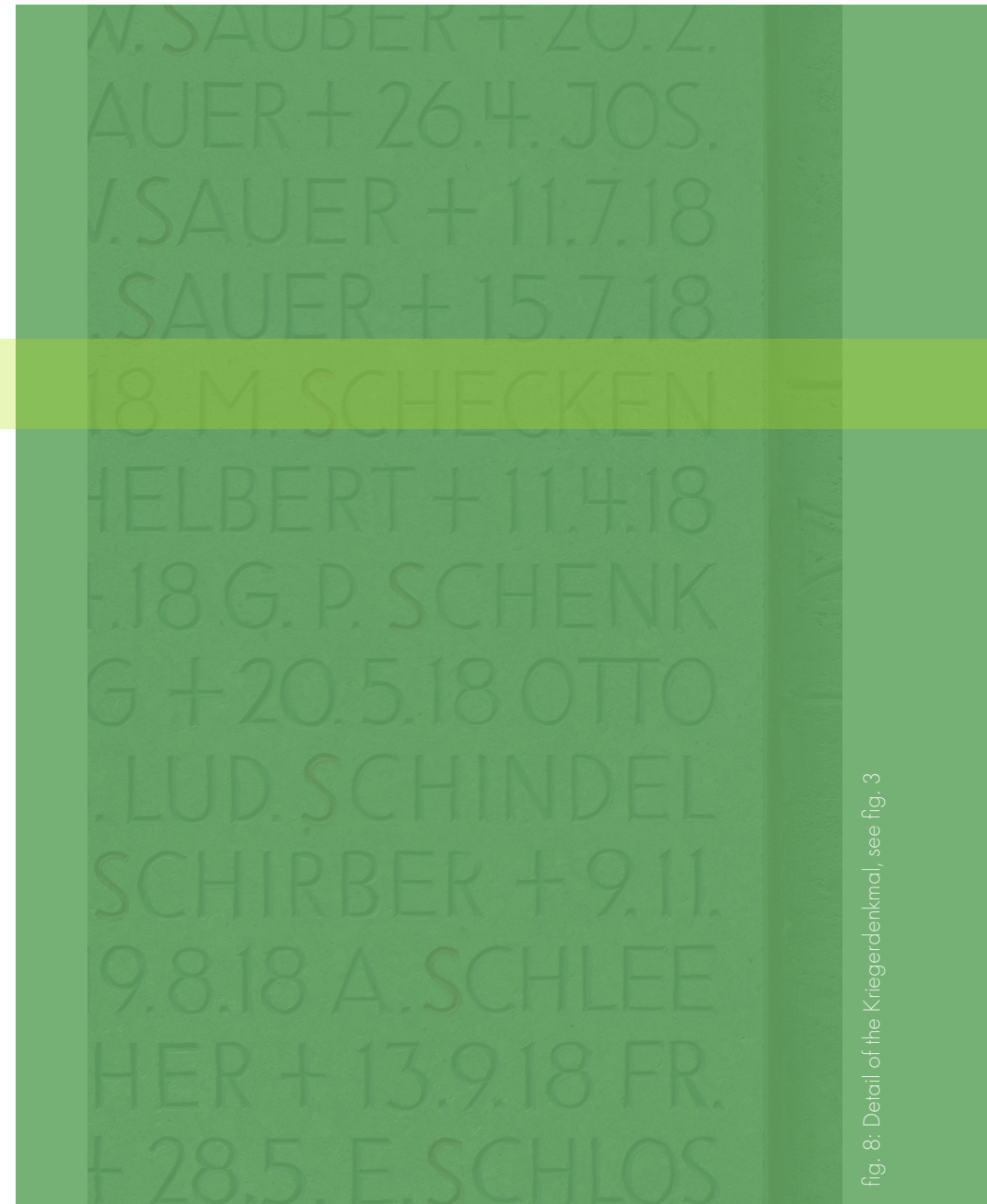
fig. 8: Detail of the Kriegerdenkmal, see fig. 3

An interesting difference is the time the memorials were built. The Studentenstein was presented to the public in 1927, the Kriegerdenkmal in 1931, and the Liberty Memorial in 1926. Yet the National World War I Memorial in Washington was only opened in 2021. The wish to preserve the memory of this war seems to be prevalent enough in American society too warrant such a construction, which is no small expense.