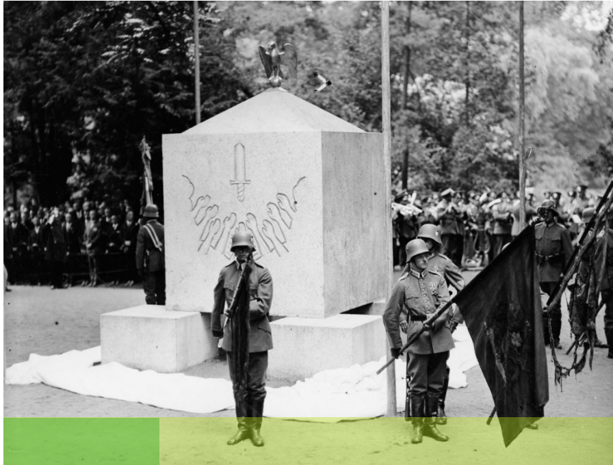
fig. 2: Unveiling of the Studentenstein in 1927.

There is currently no official event to commemorate the fallen students of both world wars that would include this memorial. Beginning in 1982 6 , there seem to be or at least have been a yearly event on the 20th of July where so called "Studentenverbindungen" 7 (in English: Student's association) hold or held a wreath-laying ceremony, but nowadays public interest and interest among students in the monument is nearly nonexistent. 8