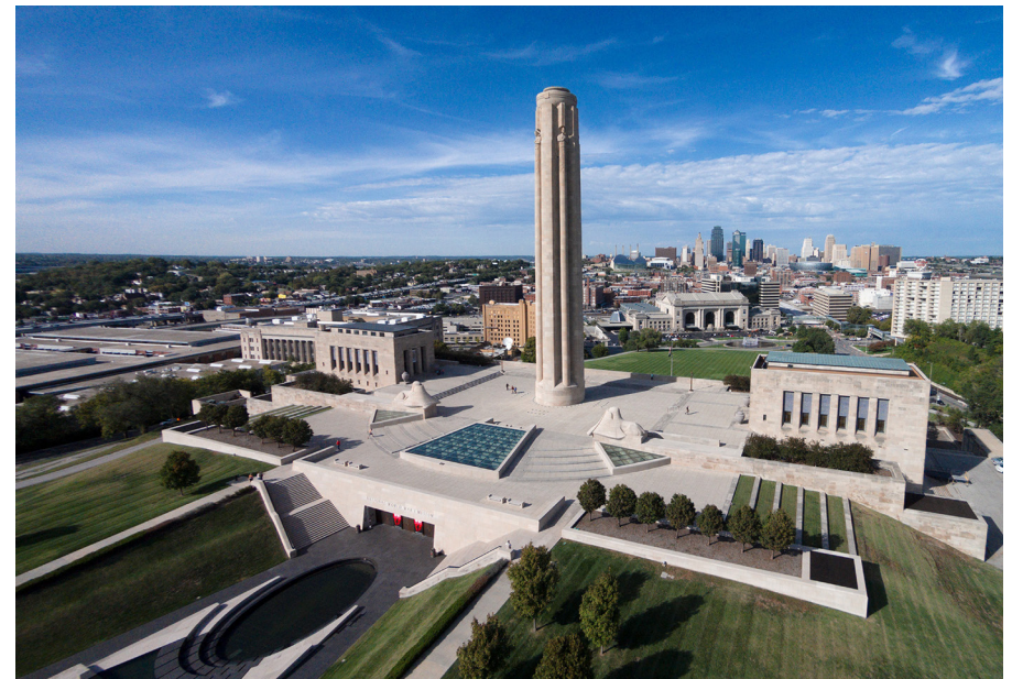
fig. 7: The National WWI Museum and Memorial in Kansas City, October 2014.

Nowadays it is still part of the Memorial, but the traveling exhibitions are now also arranged here. In 1935, a frieze of colossal proportions was added to the northern outer wall, which displays the end of the war and the beginning of a new era of peace. In addition to the figures on the frieze, there are depictions of a sword with the Stars and Stripes on it, which is supposed to represent the defense force of the USA. The inscription on the large frieze reads: "These have dared bear the torches of sacrifice and service: Their bodies return to dust, but their work liveth for evermore. Let us strive on to do all which may achieve and cherish a just and lasting peace among ourselves and with all nations." 27