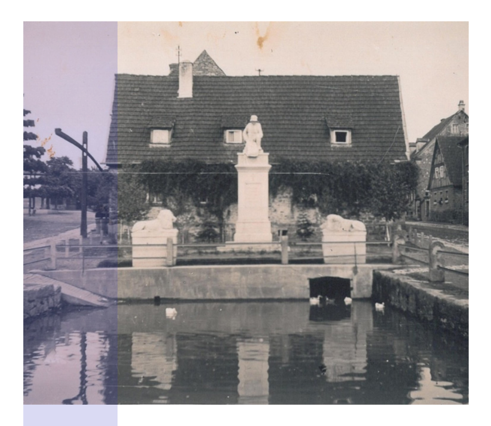
fig. 1: The monument in 1931

Memorial plaques (designed by the community Grettstadt) for World War II soldiers were built in 1959. They list Grettstadt's killed and missing soldiers from World War II. There is a date behind every name: The date of death of the killed soldiers and the date of disappearance of the missing soldiers. The erection of the memorial plaques was the first big festivity in Grettstadt after World War II.