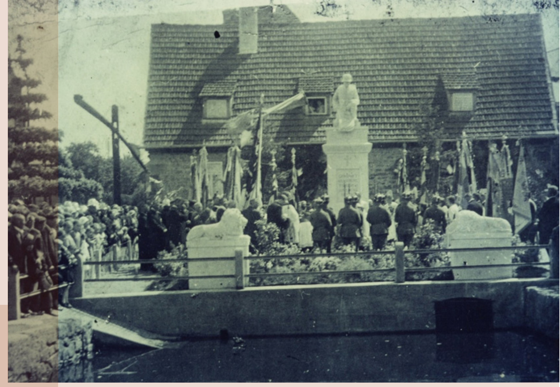
fig. 2: The monument in 1959