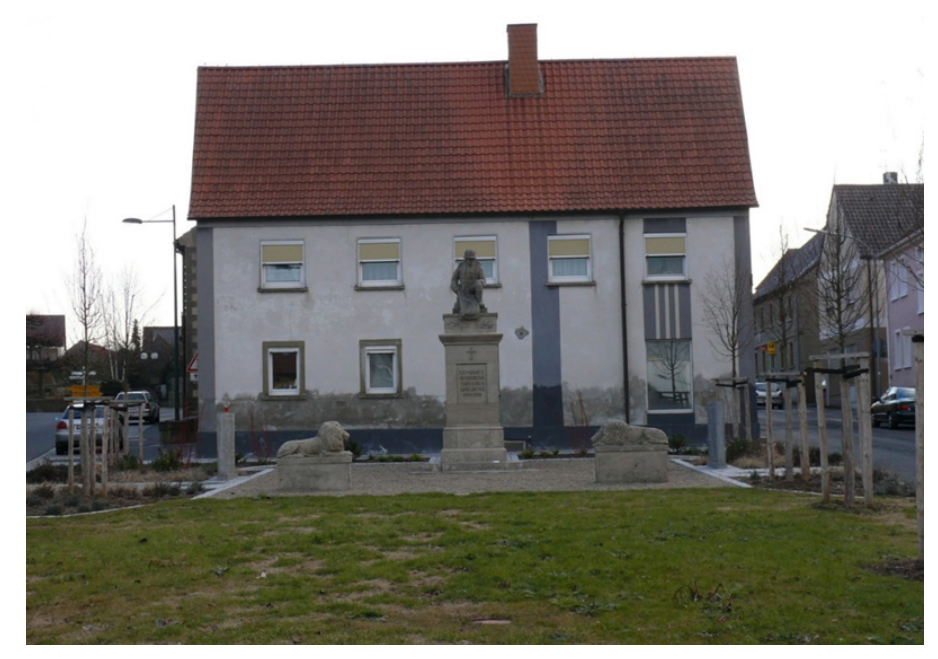
fig. 3: The monument in 2011

The monument, who is owned by the community Grettstadt, was renovated in 2007 and 2011.