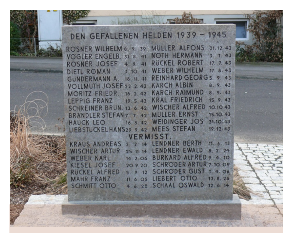
fig. 5 and 6: The memorial plaques