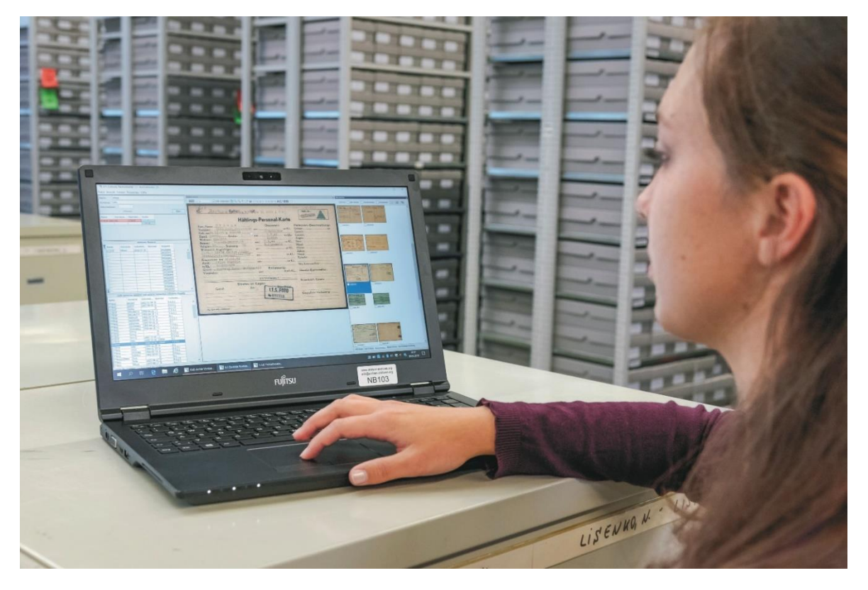
Photo 2: A woman in the collection of the Arolsen Archives clicks through the archive's catalog, which is more than 80% digitized.