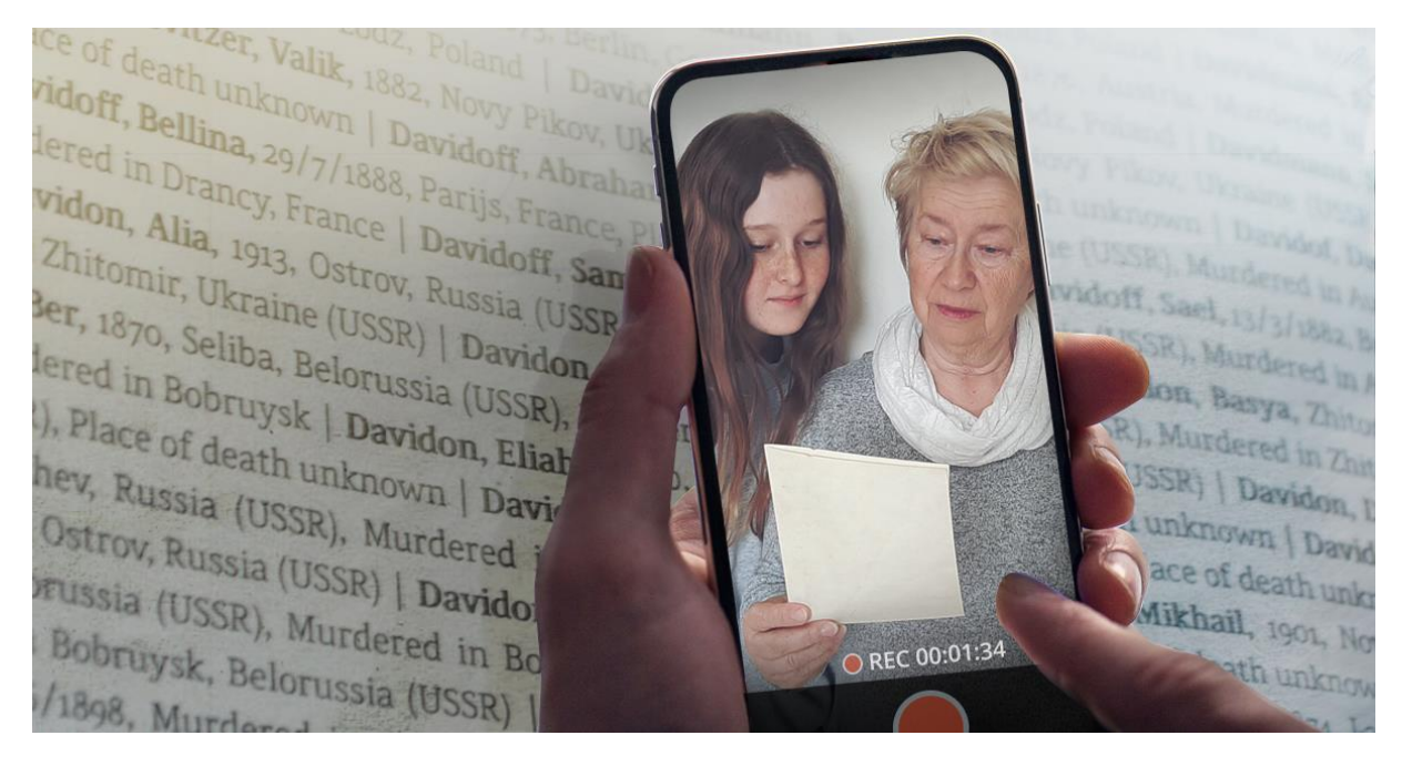
Photo 6: Two people participate in Yad Vashem's worldwide virtual name-reading campaign to mark Holocaust Remembrance Day 2020 (#rememberingfromhome #shoahnames)