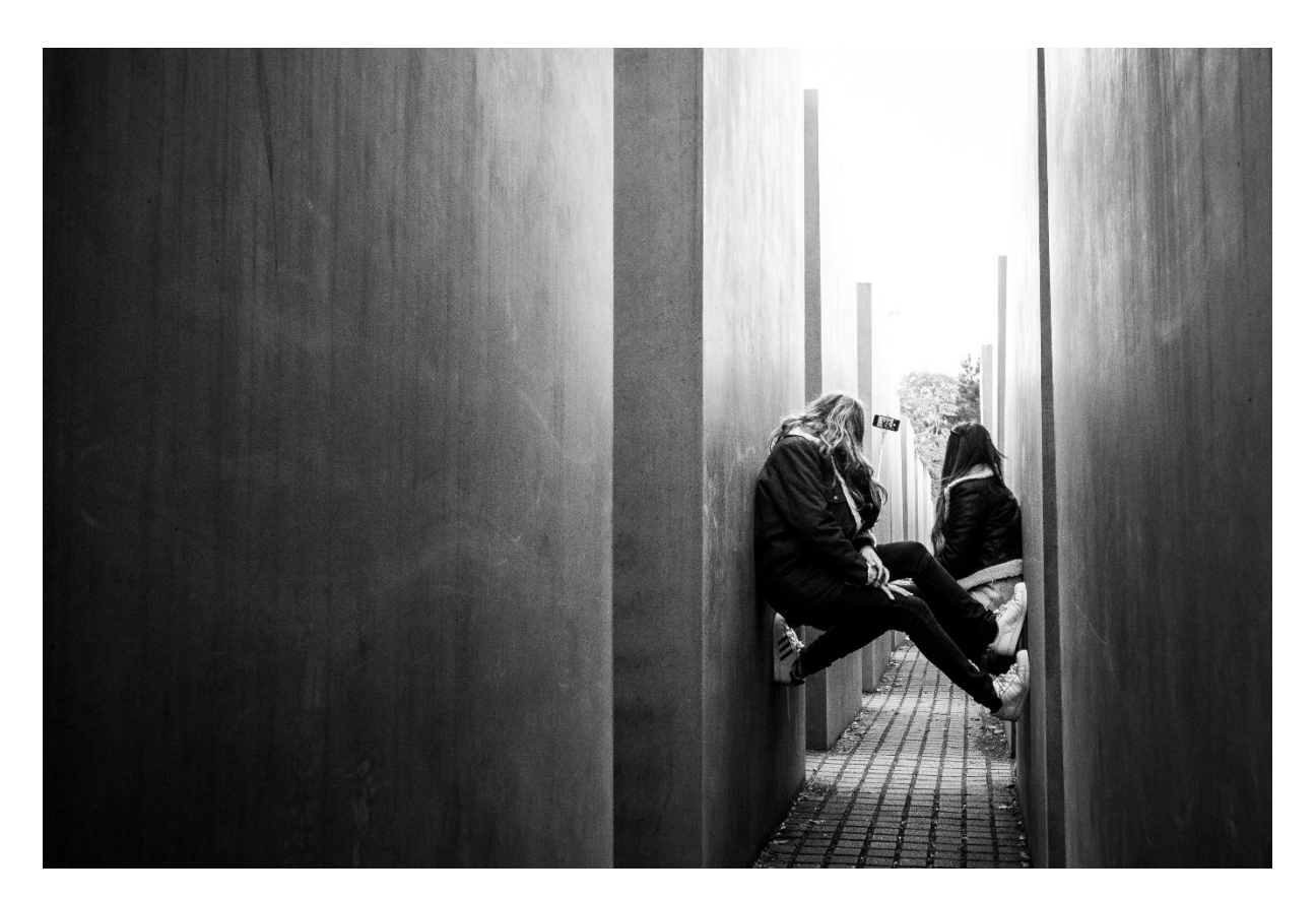
Photo 5: 2 teenage girls taking a picture at the Berlin Holocaust memorial. Is this crossing "ethical red lines"?