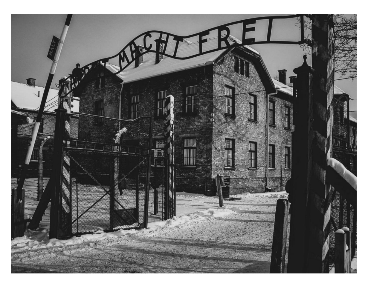
Photo 3: Entrance gate of the former concentration camp Auschwitz.