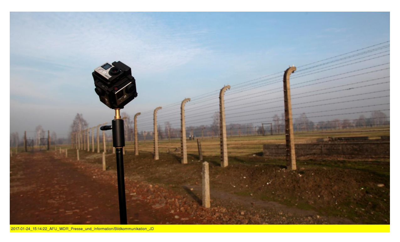
Photo 8: 360-degree camera capturing footage from the former Auschwitz concentration camp for the VR walk "Inside Auschwitz".