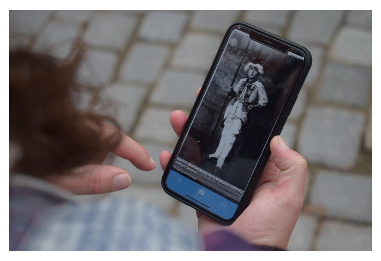
Photo 4: A young woman discovering the biographies of young Holocaust victims from Dinkelsbühl, Bavaria, using an audio guide developed by teenagers.