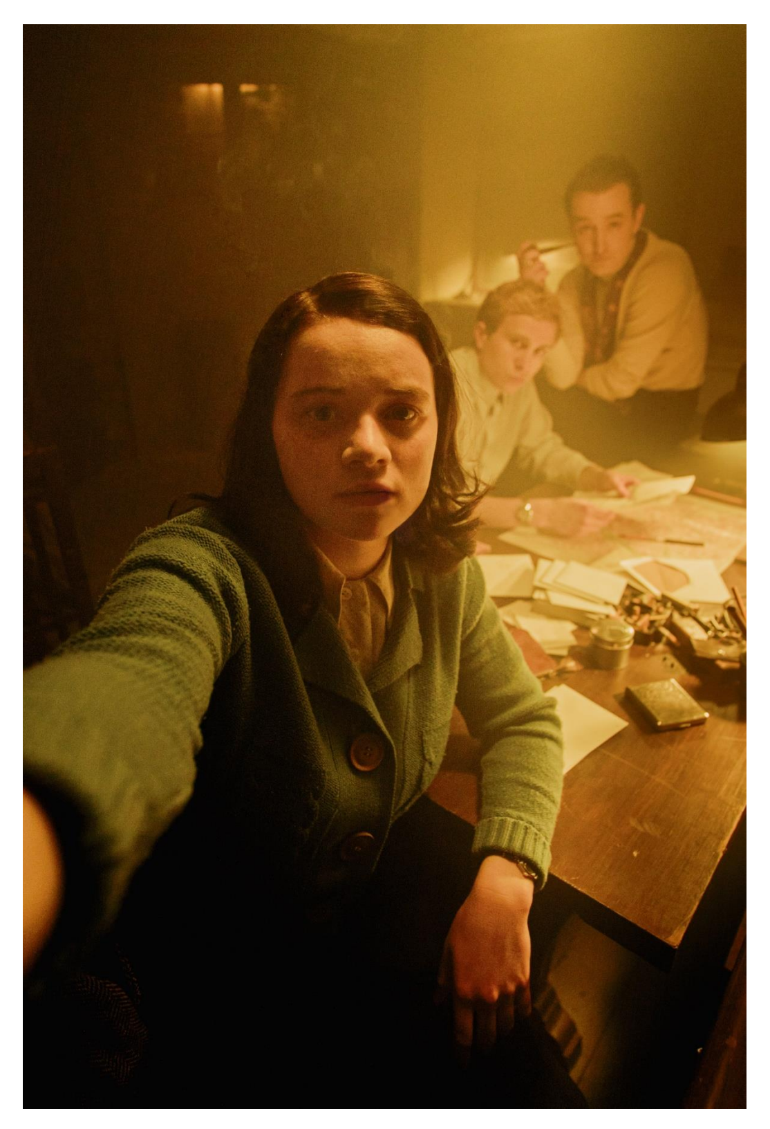
Photo 7: Actress Luna Wedler, as Sophie Scholl, takes viewers into the life of the German resistance fighter via an Instagram account.