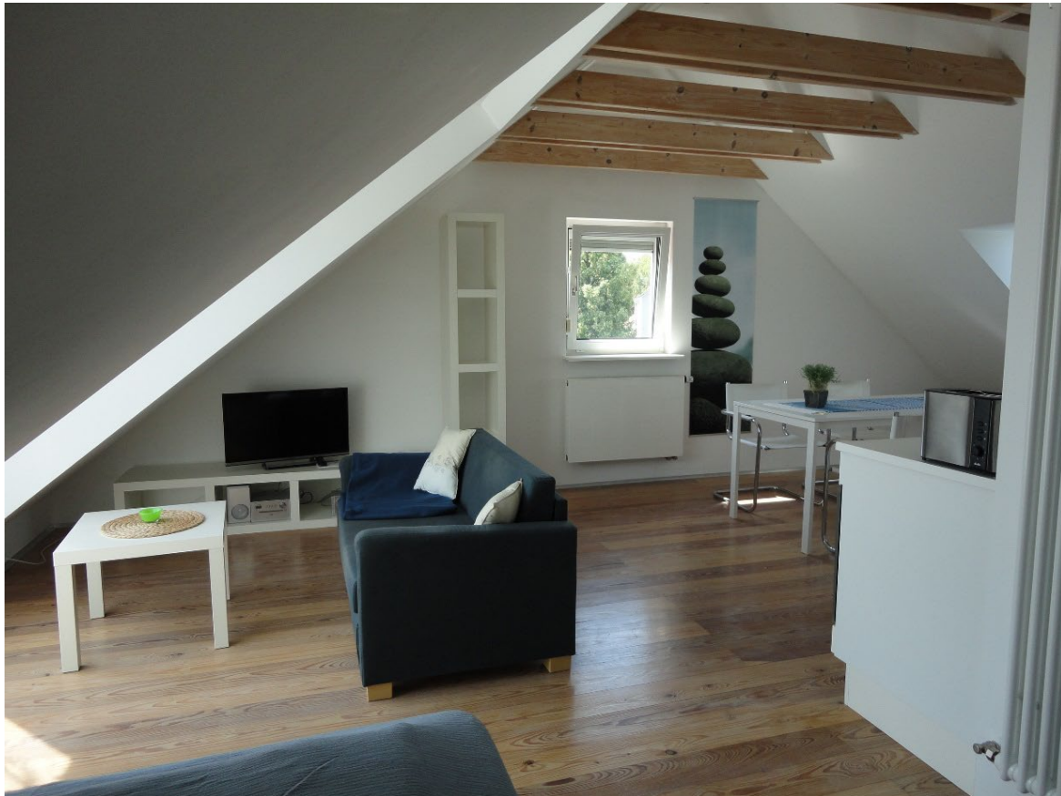
living room area