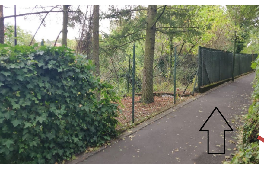
You will find some more small steps on the way