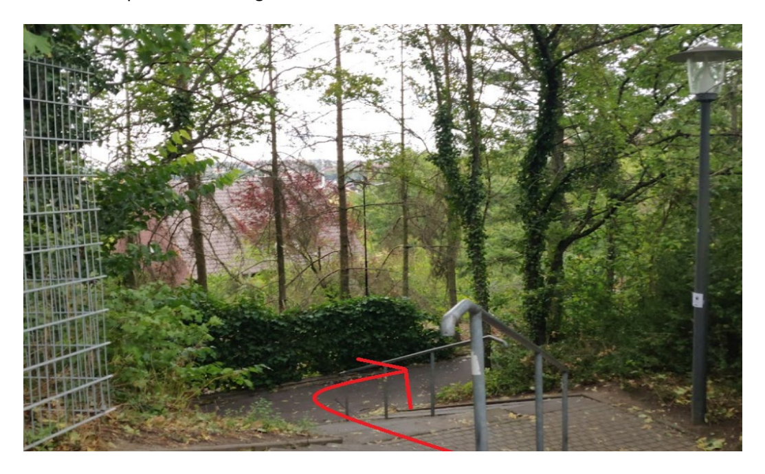
and continue walking straight.