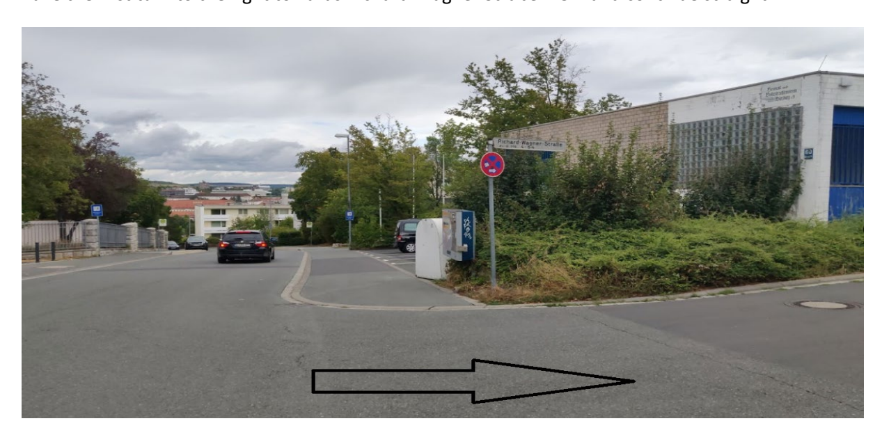
Continue walking straight.