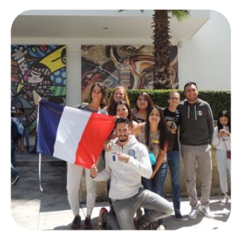
PAGE 7 · WWW.BUAP.MX | WWW.DGDI.BUAP.MX